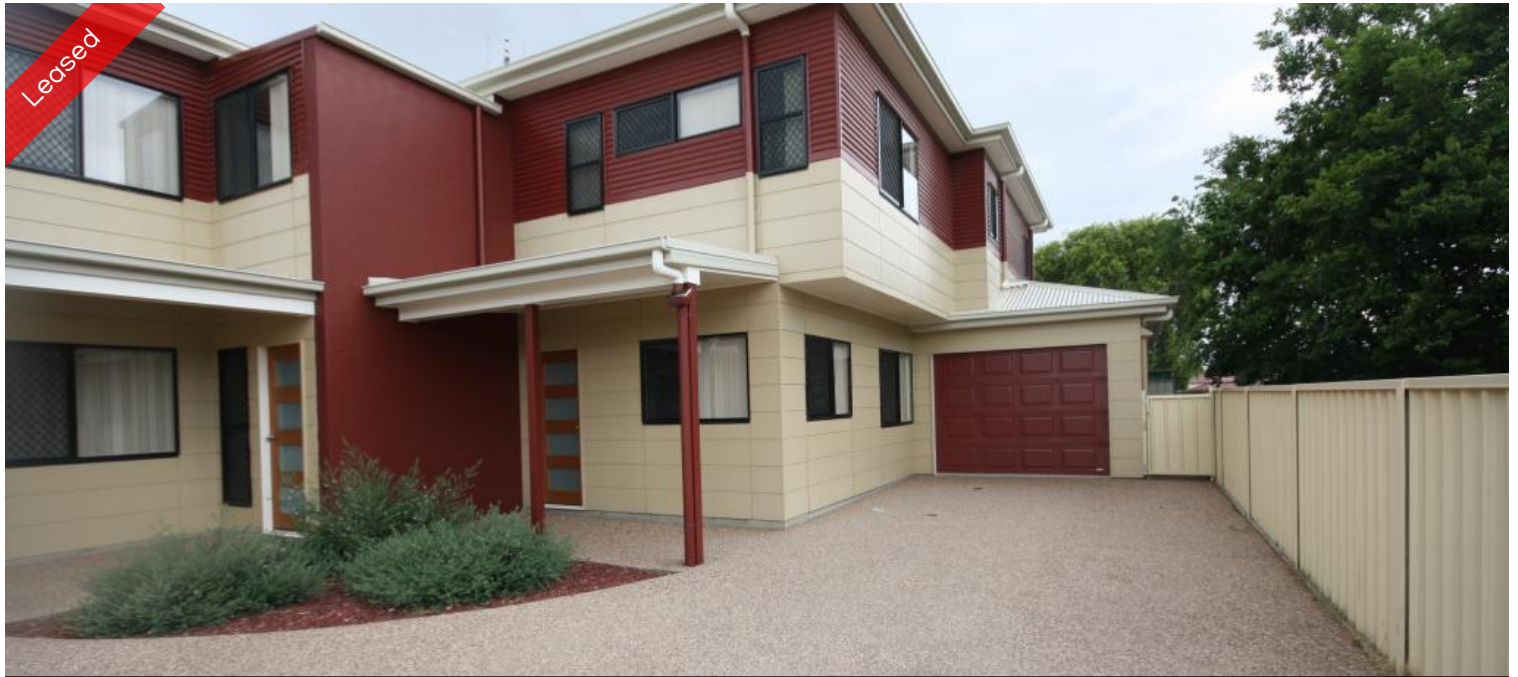
Unit B, 25 Myall Avenue, Warwick